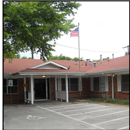
Our Co-op Facility in Bonham, Texas